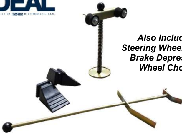
Also Included!! Steering Wheel Holder, Brake Depressor & Wheel Chocks