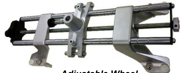
Adjustable Wheel Clamps 13" to 25"