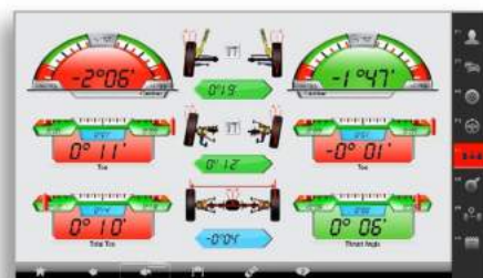
German Engineered 3D Alignment Software