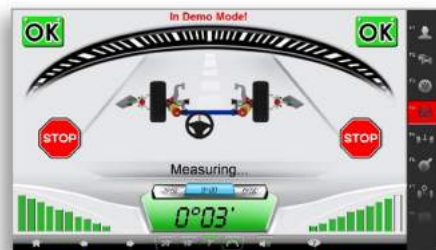
User-Friendly Screen Diagrams & Graphics