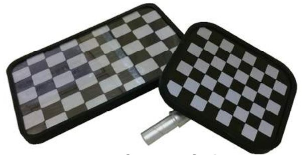
Compact Style Mini-Targets